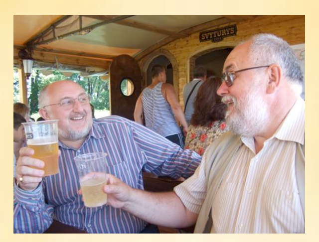
Present and future EAP Presidents discuss serious international affairs

Most enjoyable part outside therapy for me is my family, especially grandchildren. When they grow up, we started together visit different sites, listen to music I love, discuss their important life issues – what else are grandparents for?